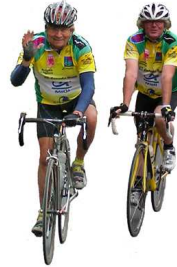
Tour de France?