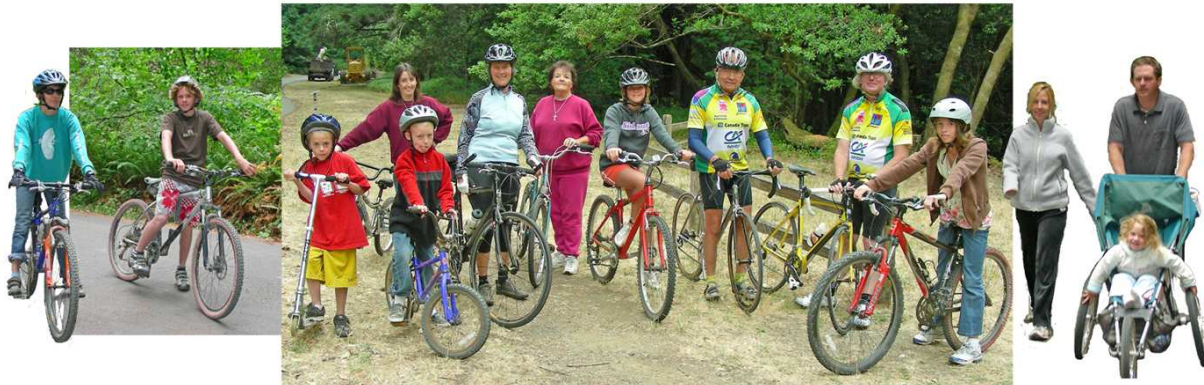
Parish Cycling Trip, July 20 th