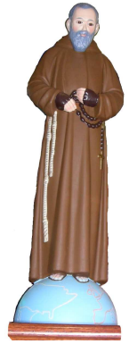
Feast Day of Padre Pio September 23 rd