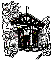
st. cecilia church lagunitas