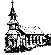
st. mary church nicasio