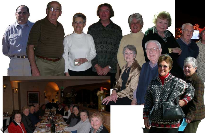
Parish Fun Train Trip to Reno