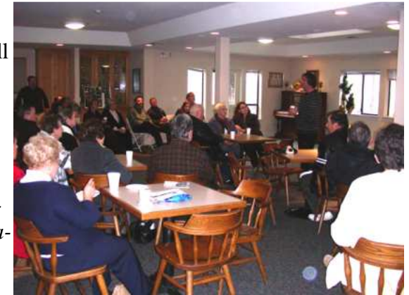
St. Cecilia's & St. Mary's Town Hall Meeting, Sunday, 1-27-2008

Feedback from the Parochial Town Hall Meeting last Sunday: "The amount of people coming to Mass late", "the coffee & cookie social hour lacks participants", "the outreach of Home Masses too few have participated", "our major social events must be supported", "a recognition of much anger amongst parishioners with the Catholic hierarchy", "the extraordinary interest in having absentee Catholics returning", "a hunger for more Catholic education", "parishioners to be more involved in liturgical service using their talents", "to have a family day at church bringing back those who grew up in our parish family now married and relocated", "we need to have more outreach on social issues."